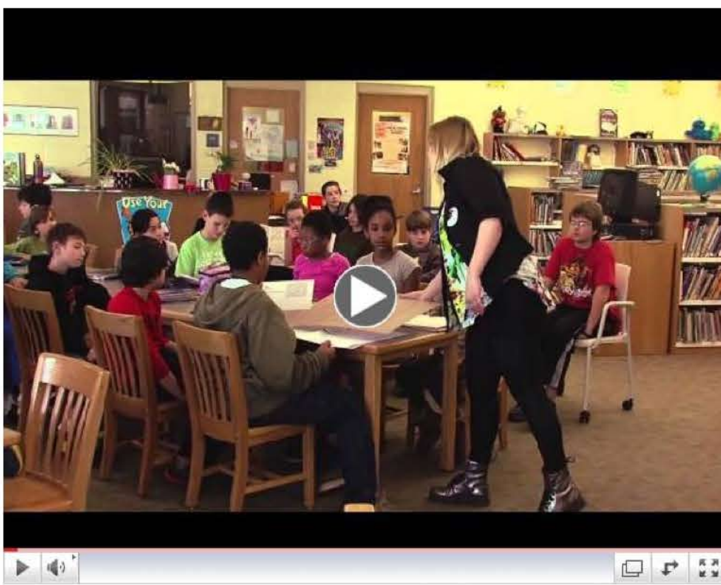
PIE in 30 Seconds

Want a quick overview of what we do? Check out our new 30 second video above! Perfect for an introduction to our case-based program teaching STEM skills to middle school students, you'll want to learn more about PIE.